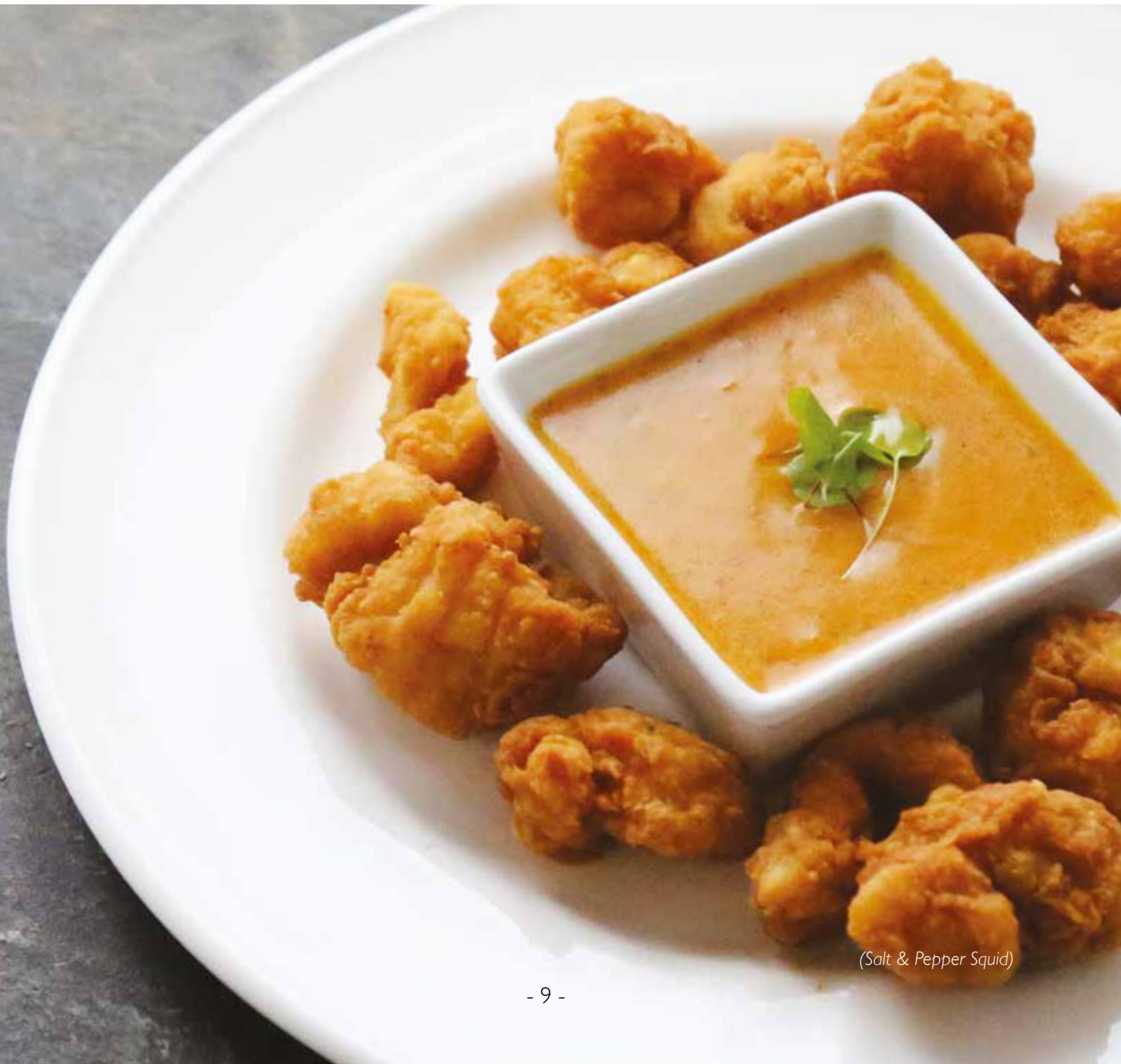
(Salt & Pepper Squid)